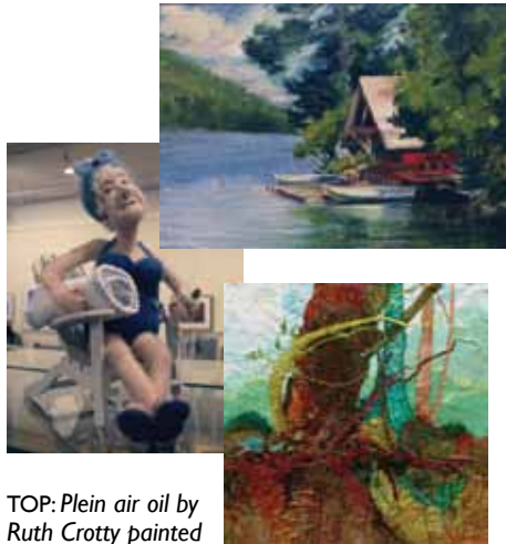
TOP: Plein air oil by Ruth Crotty painted at the Great Camp Sagamore.