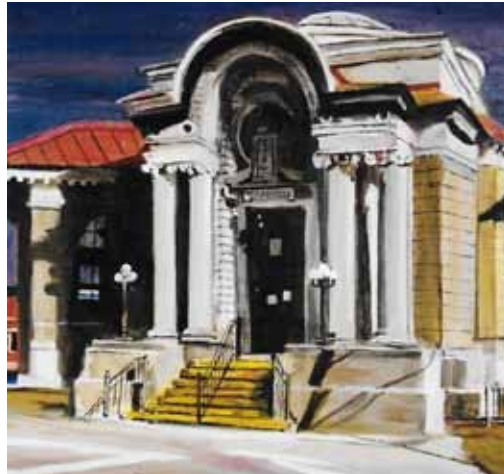
Painting of Groversville Library by Stu Eichel