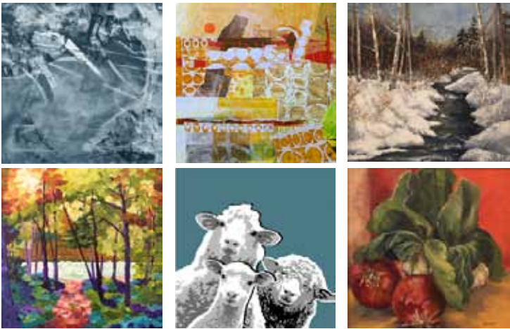
ABOVE: Six of the many 12" x 12"s in the gallery